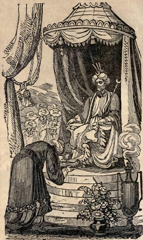
Sindbad delivering the Present of the King of Serindib, to Haroun Alraschid.